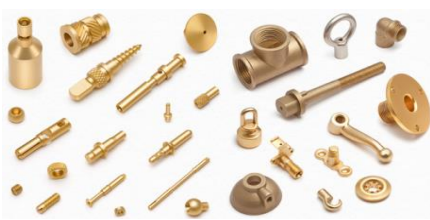
Micro Turned Component & Forgings