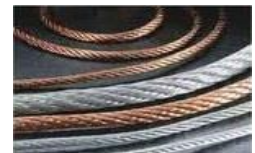
Flexible Stranded Ropes