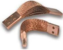
Flexible Earth Straps / Flexible Connectors