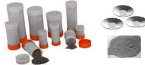
Exothermic Weld Powder Steel Disk & Ignite Powder