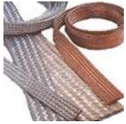
Flex. Copper Braid