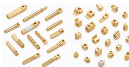
Brass Pins and Terminals