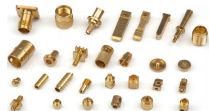
Brass Precision Parts

Any kind of special products made from Brass, Copper, Gunmetal, Bronze and Aluminium can be developed, manufactured and supplied exactly as per customer specifications as we have all in house Manufacturing facility.