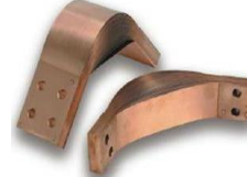
Flexible Shunts Copper Laminated