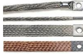
Flexible Braid Bond