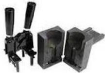
Graphite Mould & Mould Handle