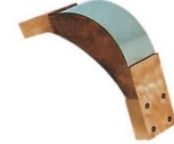
Flexible Jumpers Copper Laminated

For more information about our products, please visit our website: